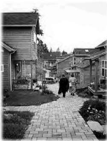
Puget Ridge Cohousing, Seattle, WA.

Avenue Community Center - 550 N. Ventura Ave., Ventura